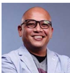
TRISULA DEWANTARA TOKOPEDIA