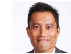
DESARACK TESO MICROSOFT