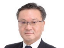
GO HASHIMOTO ATSUMI & SAKAI