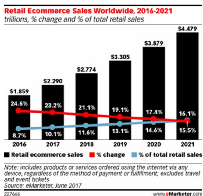
Figure 2: Anticipated size of the retail e-commerce market

The total global ecommerce market was estimated to be worth US$7.7 trillion in 2018 50 (including both the retail and business to business market). The retail ecommerce market (which excludes the business to business transactions) was estimated to be worth US$2.3 trillion in 2017, with a projected rise to nearly US$4.5 trillion by 2021. Figure 2 sets out the anticipated size of the retail ecommerce market, together with its growth rate and share of total retail revenue.