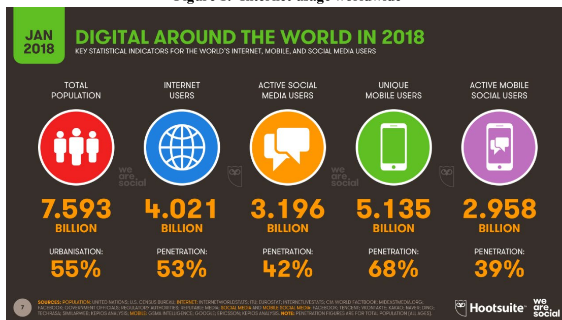
Figure 1: Internet usage worldwide

Internet usage worldwide is becoming increasingly ubiquitous, as figure 1 from Hootsuite and we are social shows. 45